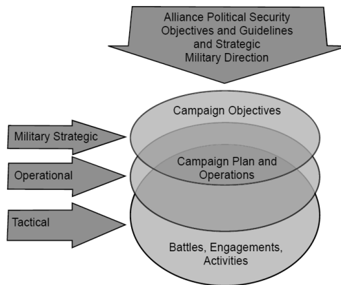
Figure 1. The Levels of Military Operations. 55

“Operations by Allied joint forces are directed at the military-strategic level and planned and executed at the operational and tactical levels.” 54